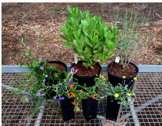
A sample of plants for sale showing pot sizes.