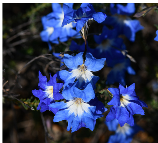
Lechenaultia biloba . We hope to have several different colour forms of this species for sale at the 12th FJC Rogers Seminar 2018 - Goodeniaceae.

12th FJC Rogers Seminar 2018 - Goodeniaceae