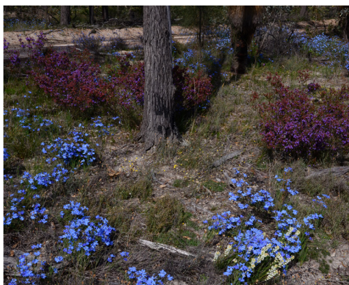
Lechenaultia biloba . Growing in Tutanning Nature Reserve with Calytrix lechenaultii .